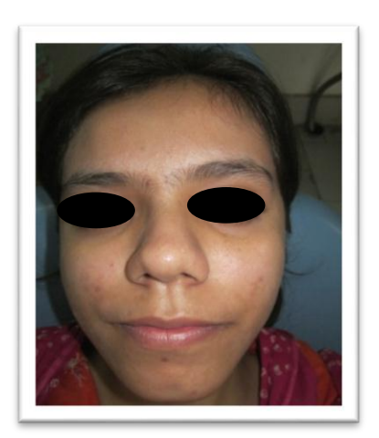
Figure 1: - Extra Oral View

General examination reveals normal and stable vital parameters, cooperative well oriented with time and place. On extra oral examination face appears to be bilateral symmetrical, lips were competent and no other abnormality was detected. There was no regional lymphadenopathy. (Figure 1)