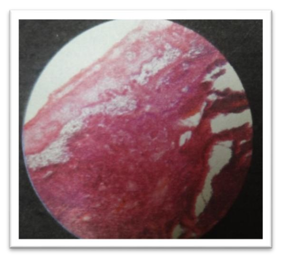
Figure 4: - Histopathological View

cells have variable morphology. Myxoid areas & basophilic calcified areas are also encountered. (Figure 4)